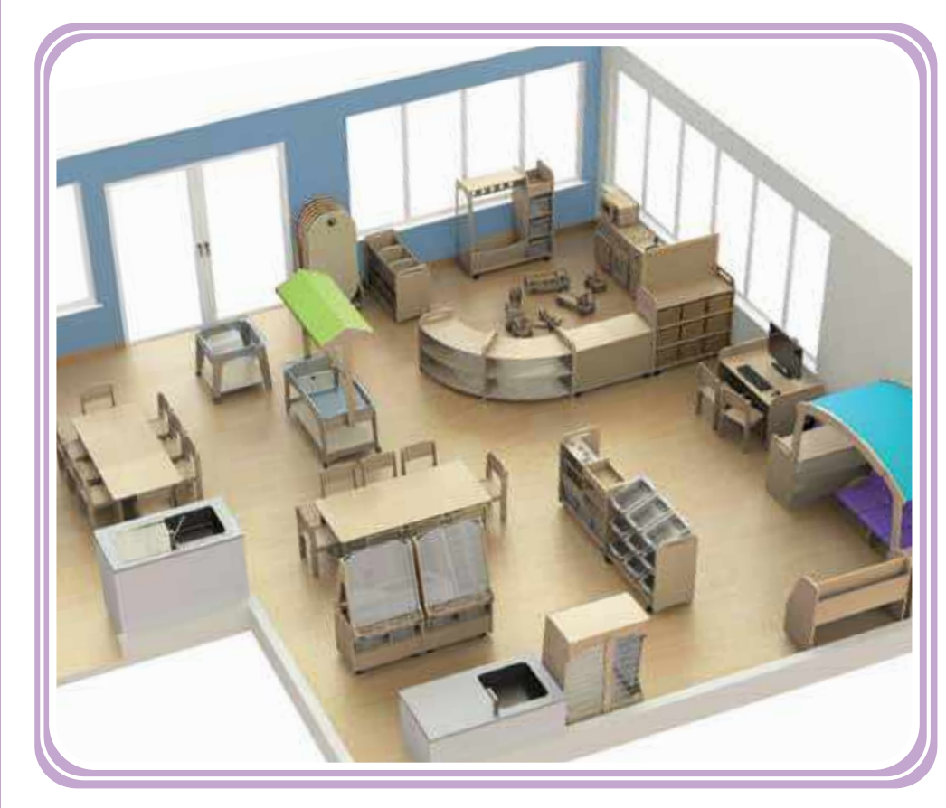
Indoor Room Planning

So, let us take the hassle out of the project for you, and give us a call on 0800 612 5432 or email sales@boardsdirect.co.uk to discuss your requirements.