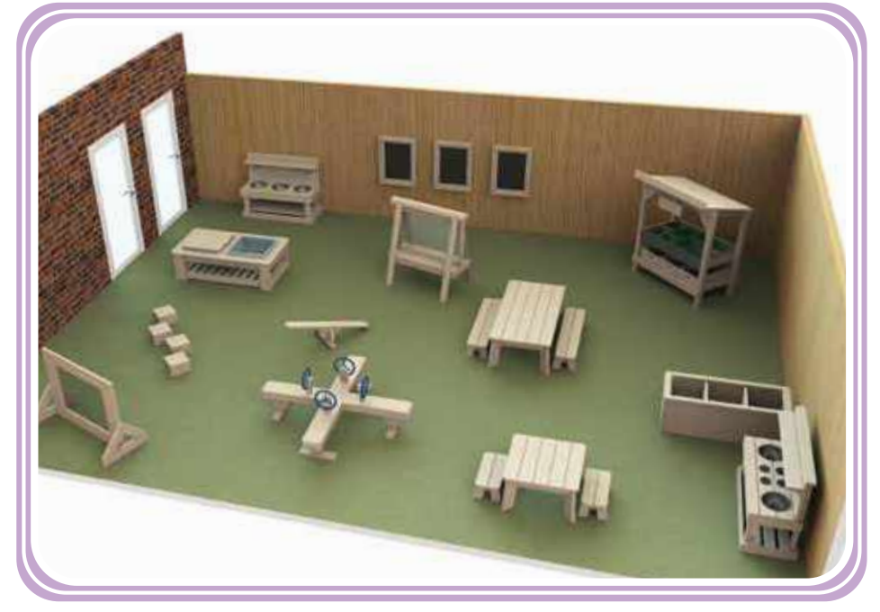
Outdoor Space Planning

We apply our knowledge and experience of early years environments, to ensure we create a space which not only meets aesthetic expectations, but delivers a functional and flexible solution that will work for you.